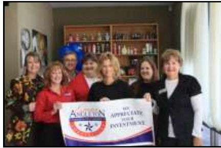
Gulf Coast Tan