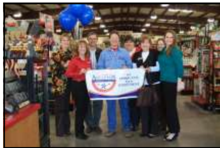
Lake Hardware & Lumber Co., Inc.