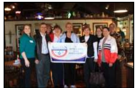
Smithhart's Texas Grill